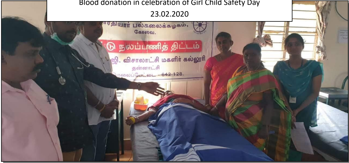
Blood donation in celebration of Girl Child Safety Day 23.02.2020